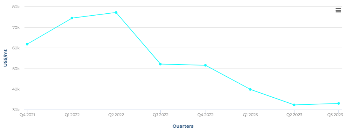
Cobalt price trend from 2021 to 2023 (Focus Economics, 2023)

According to Reuters (2023) 2 , rising cobalt supplies from Indonesia and Africa are projected to significantly outstrip the demand from electric vehicles in the next few years, leading to substantial surpluses that will exert downward pressure on cobalt prices. Chinese firms are planning to significantly increase cobalt production capacity in Indonesia, which could result in a substantial jump in cobalt supplies from the world's second-largest producer to 83,800 tonnes by 2027, accounting for more than 30% of the total supply compared to 10% in 2022. However, on the demand side, China's electric vehicle industry is shifting from nickel, cobalt, and manganese (NCM) chemistry to cheaper lithium iron phosphate (LFP) batteries, leading to slower growth in cobalt demand than previously anticipated. It is anticipated that this shift will be partially offset by increased electric vehicle sales. As at the date of this announcement, cobalt metal prices plummeted to their lowest point in two years, falling to price averaged US$32,982 per metric tonne in September 2023 (September 2022: US$52,082 per metric tonne) 3 . This marked a 57.2% decrease or US$44,137 per metric tonne from June 2022 when the market began to factor in the impending oversupply.