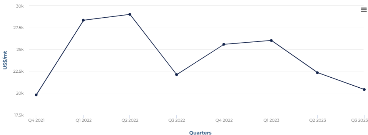
Nickel price trend from 2021 to 2023 (Focus Economics, 2023)

The pricing for nickel is under pressure due to oversupply in the market. According to Focus Economic (2023), the price of nickel fell from an average of US$26,033 per metric tonne in January 2023 to an average of US$20,396 per metric tonne. This decline amounts to a decrease of 21.7% despite reported increase demand in China. This drop in price is primarily attributed to a growing market surplus in July 2023 4 .